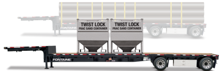
Velocity TX wide spread air ride dropdeck Setup with twistlocks for one 10' bin, one 12' bin, or two 8' bins Haul frac sand or regular dropdeck loads with the same trailer 48' configuration • Frame rating 80,000 lbs distributed