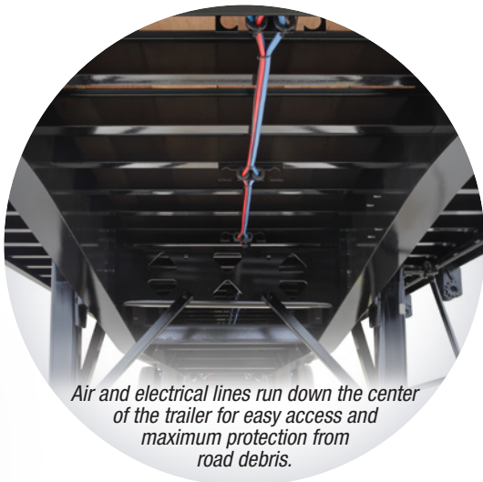
Air and electrical lines run down the center of the trailer for easy access and maximum protection from road debris.