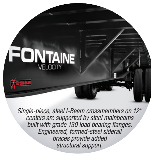
Single-piece, steel I-Beam crossmembers on 12" centers are supported by steel mainbeams built with grade 130 load bearing flanges. Engineered, formed-steel siderail braces provide added structural support.