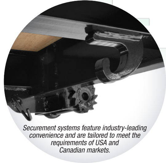
Securement systems feature industry-leading convenience and are tailored to meet the requirements of USA and Canadian markets.