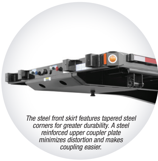
The steel front skirt features tapered steel corners for greater durability. A steel reinforced upper coupler plate minimizes distortion and makes coupling easier.