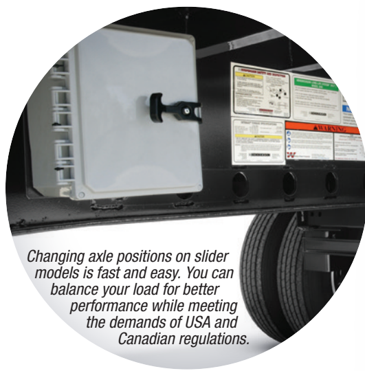
Changing axle positions on slider models is fast and easy. You can balance your load for better performance while meeting the demands of USA and Canadian regulations.