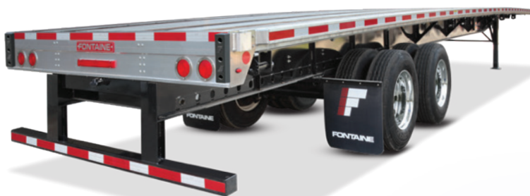
The versatile Infinity SuperiorSlide™ trailer features independent sliding front and rear axles to give you SUPERIOR maneuverability for local city hauls ... and SUPERIOR stability on the highway. The versatile design enables you to be "street legal"* in all 50 states and Canada with a single trailer.

Contact your local Fontaine® dealer today, and put an Infinity™ flatbed or dropdeck trailer to work for you!