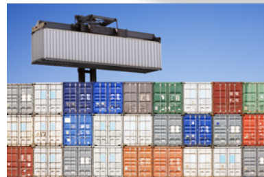
With 8 retractable twistlocks, the Fontaine Infinity TX handles typical dropdeck loads or two 20-ft containers, or one 40-ft container.