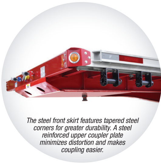
The steel front skirt features tapered steel corners for greater durability. A steel reinforced upper coupler plate minimizes distortion and makes coupling easier.