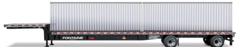
Infinity TX rear axle slide air ride dropdeck Setup with 8 twistlocks for one 40' container or two 20' containers Haul containers or regular dropdeck loads with the same trailer 51', 53' and 53' low deck height configurations • Frame rating 80,000 lbs distributed