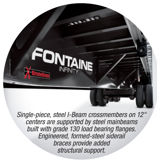
Single-piece, steel I-Beam crossmembers on 12" centers are supported by steel mainbeams built with grade 130 load bearing flanges. Engineered, formed-steel siderail braces provide added structural support.