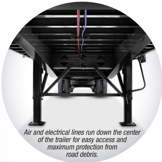
Air and electrical lines run down the center of the trailer for easy access and maximum protection from road debris.